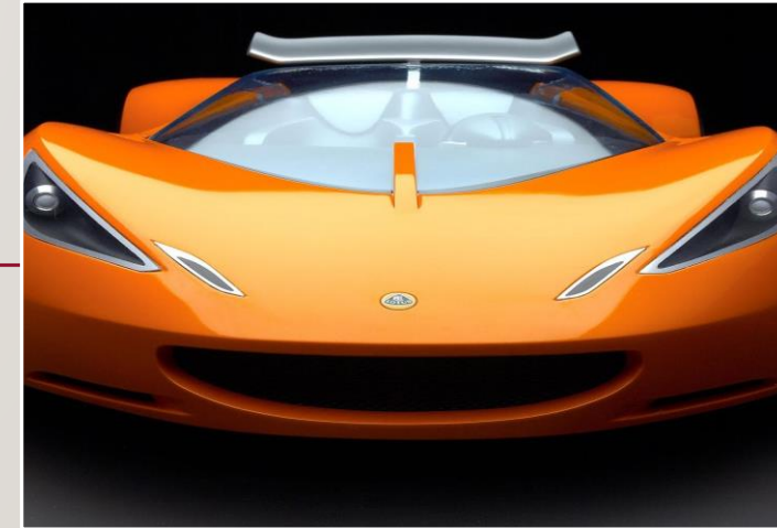
CAR RENTAL OVERSEA